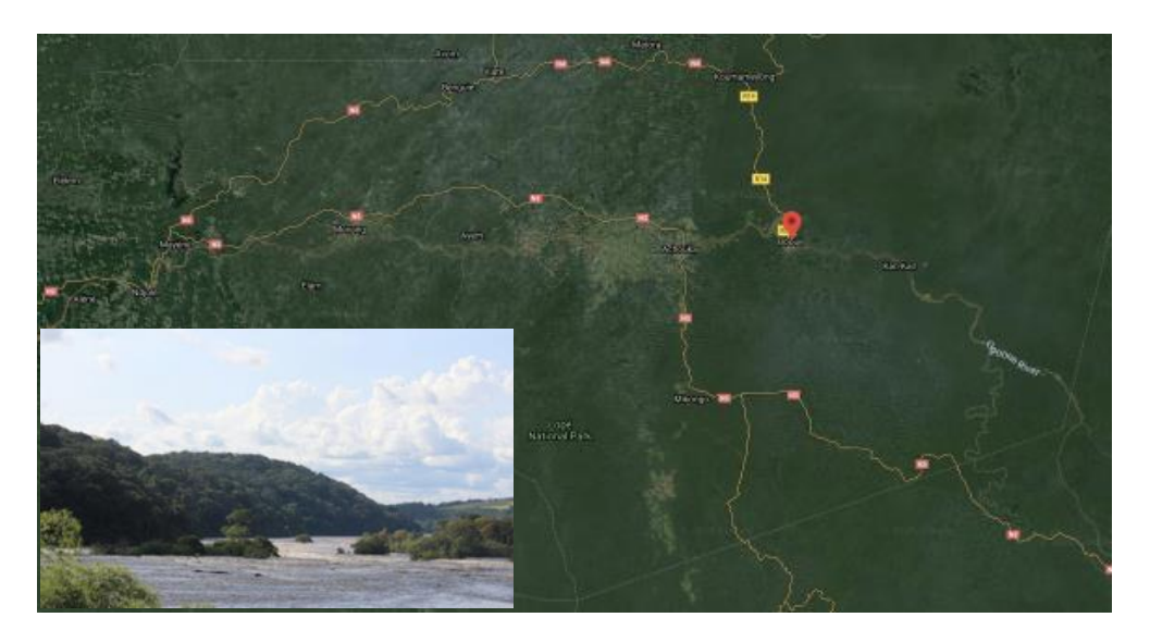
Forests in proximity of the school are composed of a mix of Protected Areas (Lope)

Bouee, where the school is located, is a small town situated on the Ogooué River, in the province of Ogooué-Ivindo. It is the capital of the Lopé department. Forest surrounding the zone are composed of a complex landscape of logging concessions and protected areas, serving as an ideal site for the technical training of Ministry Agents. The region is assessible by road and rail.