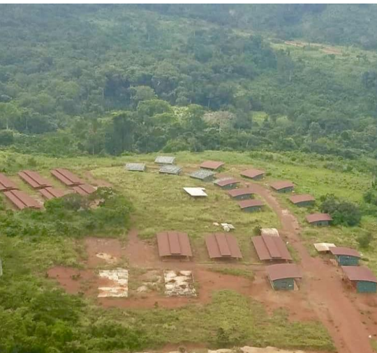
AERIAL PHOTO OF BOUEE TRAINING CENTER

The school has a capacity of 200 students. It covers 7-8 hectares and includes: