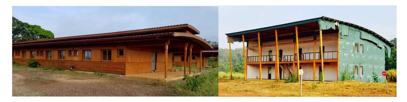
EXAMPLE OF EXISTING BUILDING CONDITIONS

Bouee, where the school is located, is a small town situated on the Ogooué River, in the province of Ogooué-Ivindo. It is the capital of the Lopé department. Forest surrounding the zone are composed of a complex landscape of logging concessions and protected areas, serving as an ideal site for the technical training of Ministry Agents. The region is assessible by road and rail.