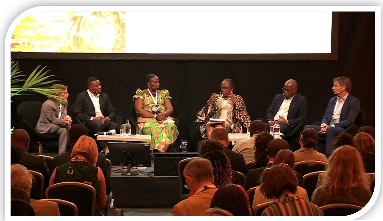
Well-attended CAFI event at the Oslo Tropical Forest Forum

Watch CAFI's full event at the Oslo Tropical Forest Forum: Win-win opportunities for people and forests in Central Africa (vimeo.com)