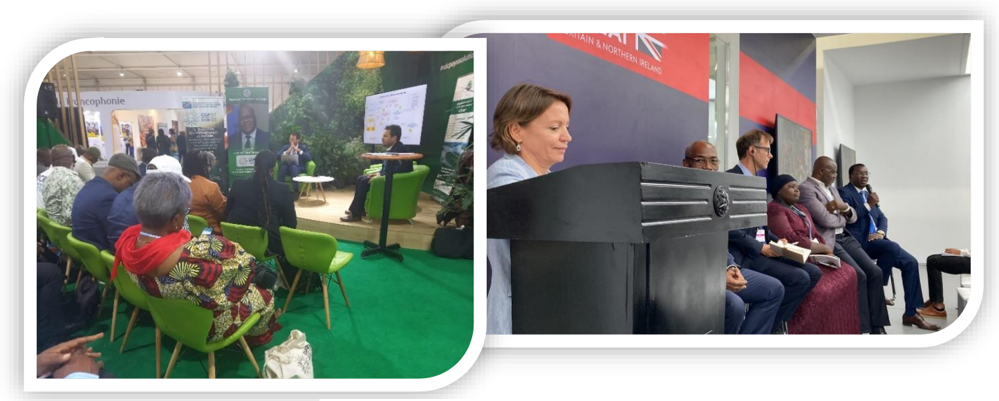
CAFI Secretariat events at COP-27