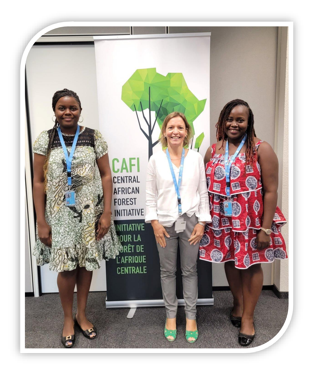
CAFI Director with the first two fellows under the CAFI Fellowship programme

Building expertise among young central African professionals in human development and climate change mitigation is essential for long-term forest protection in the region. That's why CAFI launched a fellowship program at its Secretariat in Geneva, to invite young talents from the region to join its team for one year and grow skillsets that can in turn benefit future actions for Central African forests and people. The first two fellows, two women from Cameroon, joined the CAFI Secretariat team in 2022.